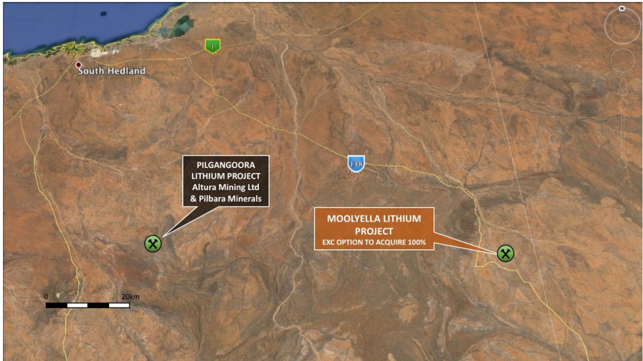
Figure 1: Moolyella Lithium Project Tenement Location Plan

As previously reported the Moolyella Project is located just 23 km ENE of Marble Bar and consists of EL 45/4462 covering 86 sq km, holding a substantial position in a highly mineralised Li, Sn, Ta district in the Pilbara region of WA. (Figure 1).